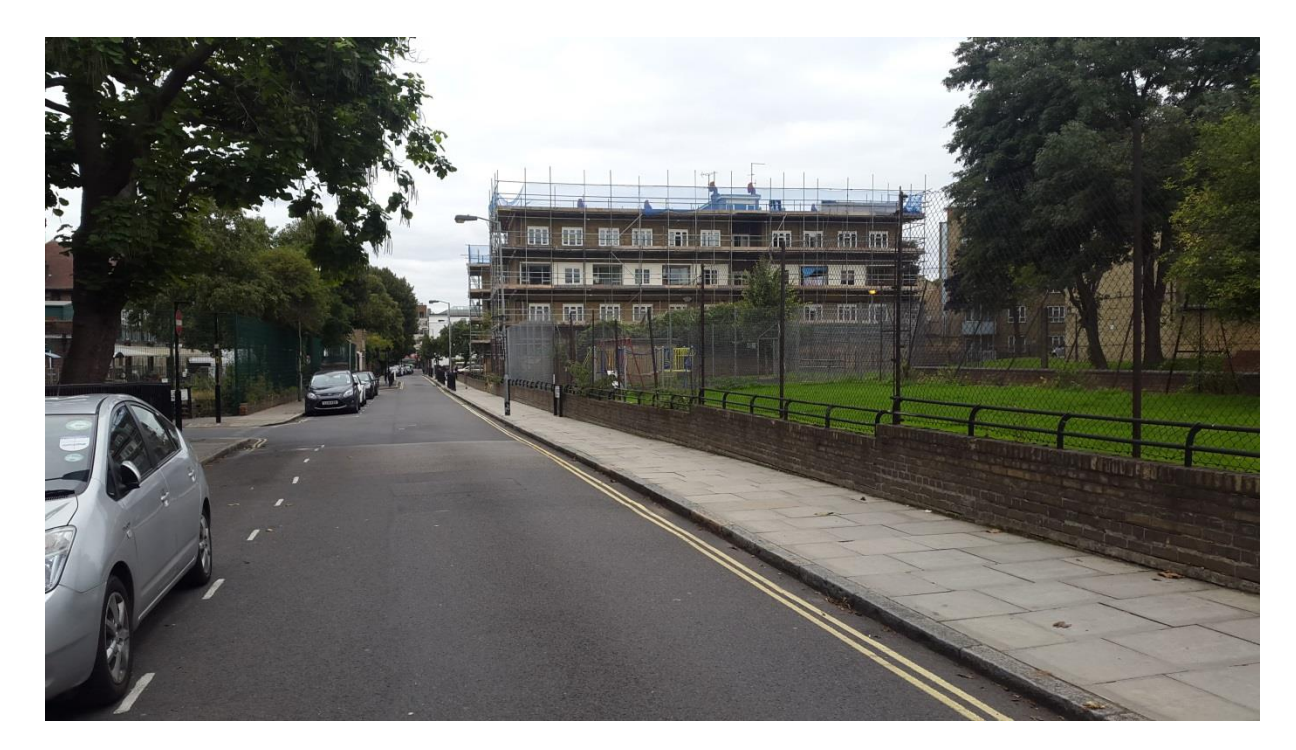
Image 2: View of existing site looking down George's Road to the east